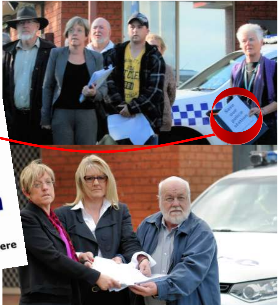
2014 Meet the Candidates Forum, Victorian State Election – the association sponsors forums for every local, state and federal election